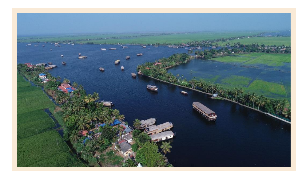
23 November 2024 Saturday